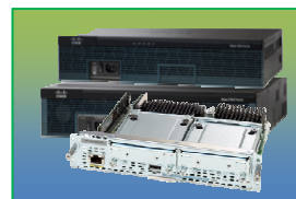
Cisco WAAS Modules in Cisco ISR G2 Routers

Performance at scale for Citrix XenDesktop delivered to enterprise branch offices