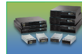
Cisco WAAS Appliances