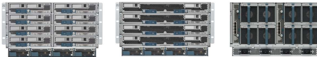
Figure 2. Cisco UCS 5108 Blade Server Chassis with Blade Servers Front and Back.