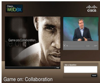
Cisco Collaboration: Game On