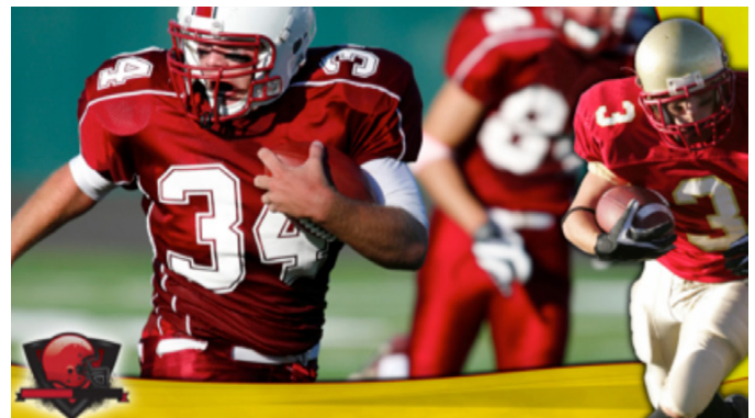
Figure 4. Example of a Team Video Overlay

Part of enhancing the fan experience is immersing the fan in an atmosphere that resonates with the spirit of the team. This immersion is achieved by displaying images of the team, its colors, and its logo throughout the venue, including on the video displays. As part of the Content Creation Service for Cisco StadiumVision, the creative services team can design and develop advertisements for team merchandise and upcoming events, video wrappers and overlays that depict a team logo or player (as shown in Figure 4), and full-screen team signage