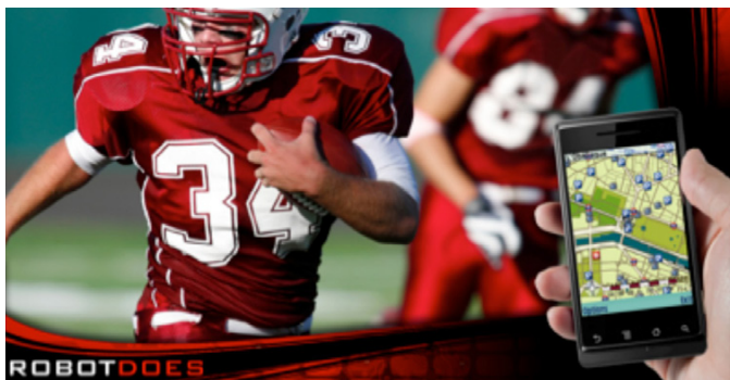
Figure 6. Example of Sponsor Content

The creative services team can also provide training venue staff to aid in selling sponsor activation packages (described in the following section).