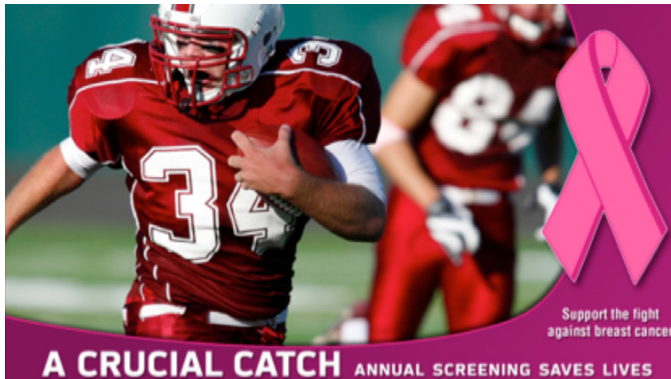
Figure 5. Example of Team Promotional Overlay