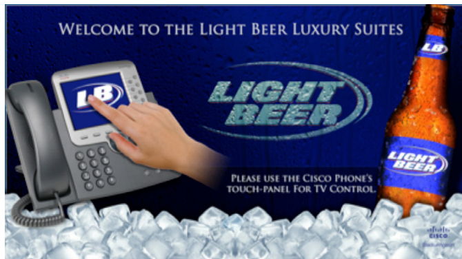
Figure 3. Example of a Customized Luxury Suite Welcome Message

Within the luxury suites, Cisco StadiumVision allows you to enhance and personalize the premium fan experience through the use of customized welcome displays for suite owners and guests. As part of the Content Creation Service for Cisco StadiumVision, the creative services team will design and develop welcome messages that include advertisements and logos of suite sponsors (as shown in Figure 3) as well as personalized messages for the suite guests.