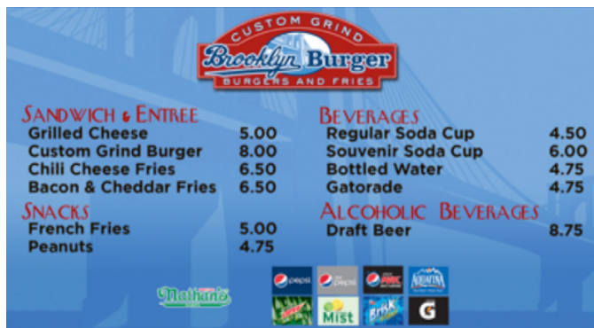
Figure 2. Example of a Digital Menu Board

Menu boards should have eye-catching graphics with easily readable content incorporated into a flexible and attractive layout (as shown in Figure 2). As part of the Content Creation Service for Cisco StadiumVision, the creative services team will design and develop themed menu boards, set up the dynamic pricing through Cisco StadiumVision Director, and provide customized product shots.